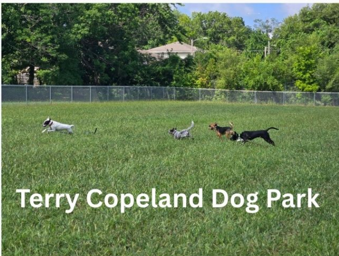
Terry Copeland Dog Park

Redevelopment of Kenagy Park will be the recipient of the remaining $1M OMNIBUS grant, which will fund new equipment for the Skate Park, a new restroom, ADA approved playground surface on our main playground at Kenagy, and ADA compliant additions to our walking trails. The Board of Aldermen awarded the contract to McConnell & Associates. The Skate Park equipment should be installed sometime in February 2026.